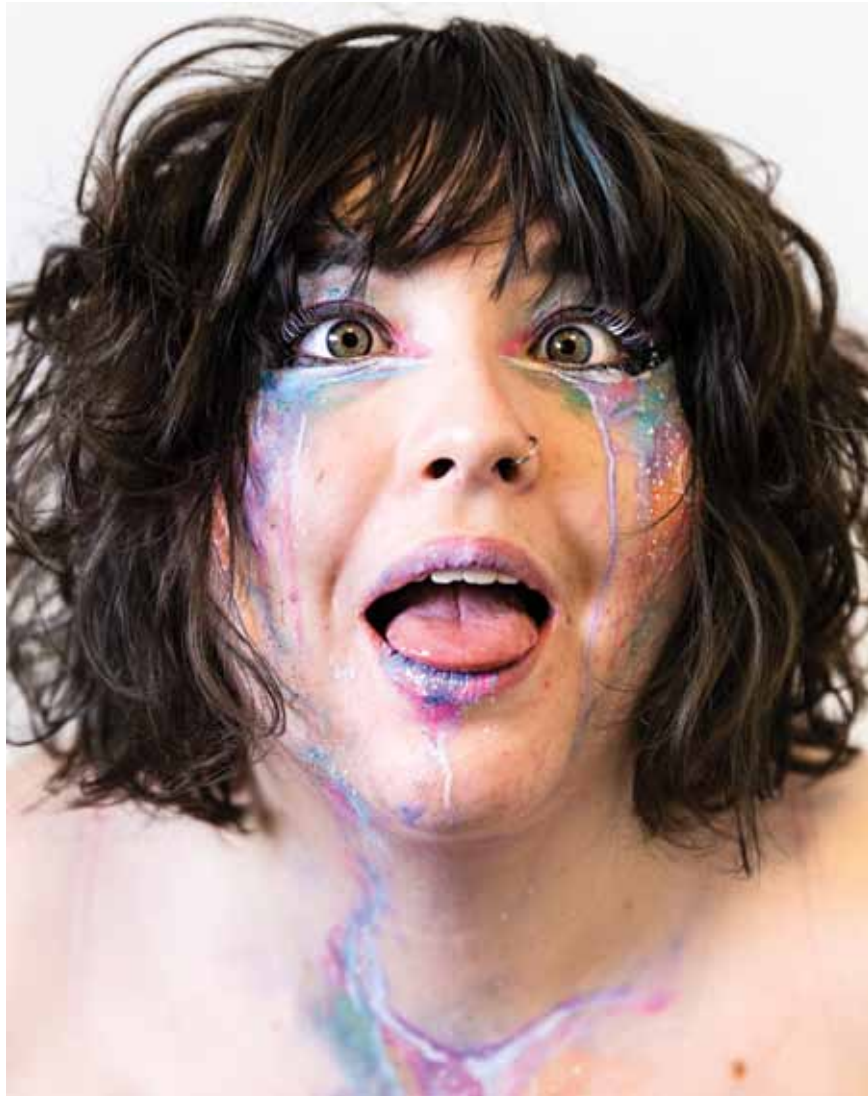
OPPOSITE Lachlan Turk Queen of Nature 2019 pigment ink digital print on Ilford Smooth Pearl 21 × 29.5 cm