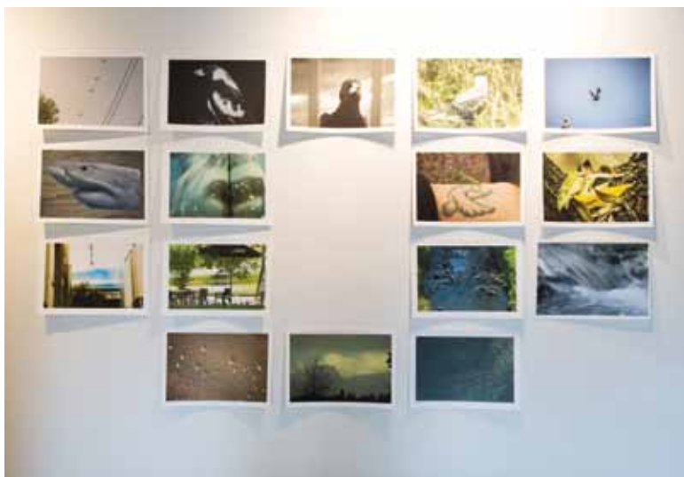
Photography by Miles Howard-Wilks in the 2019 group exhibition The World Around Us