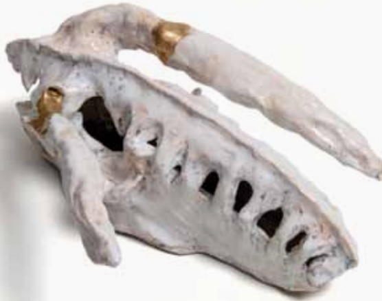
ABOVE Bronwyn Hack Not titled 2018 glazed earthenware 20 × 44 × 34 cm Private Collection