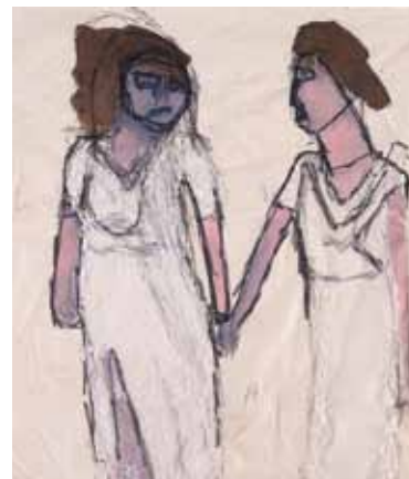
Adrian Lazzaro Lesbian Wedding 2018, Private Collection

Supported by: Art Guide Australia From the city to the sea marked the first solo show for Malcolm and evoked our natural and built environments.