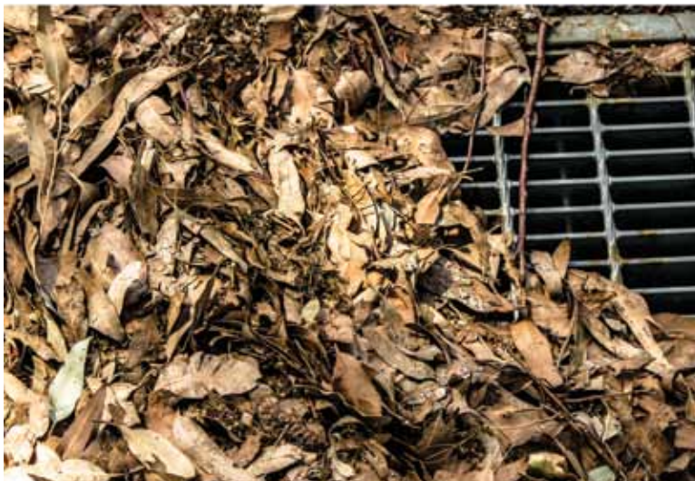
Miles Howard-Wilks Leaves and Sticks Wash Up on the Drain 2018 from the group exhibition The World Around Us

The world around us literally refers to a five-block radius around the Arts Project Australia studio. Each week as the seasons change and the weather alters, so changes the landscape and our perceptions of it.