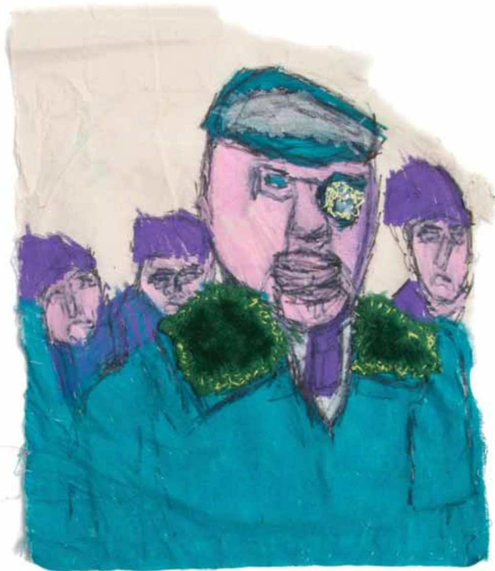
ABOVE Adrian Lazzaro Not titled 2018 marker, fur and plastic on cotton 36 × 29 cm