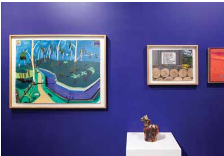
Installation from the 2019 group exhibition Our Life, Our World