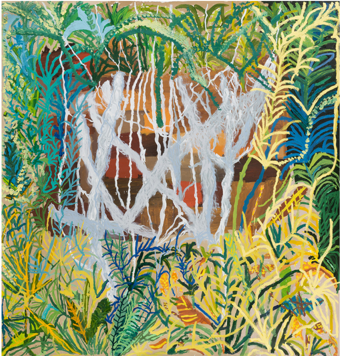
Not titled 2017 acrylic on canvas 166 x 160 cm GSCV17-0002 $1500 > purchase online