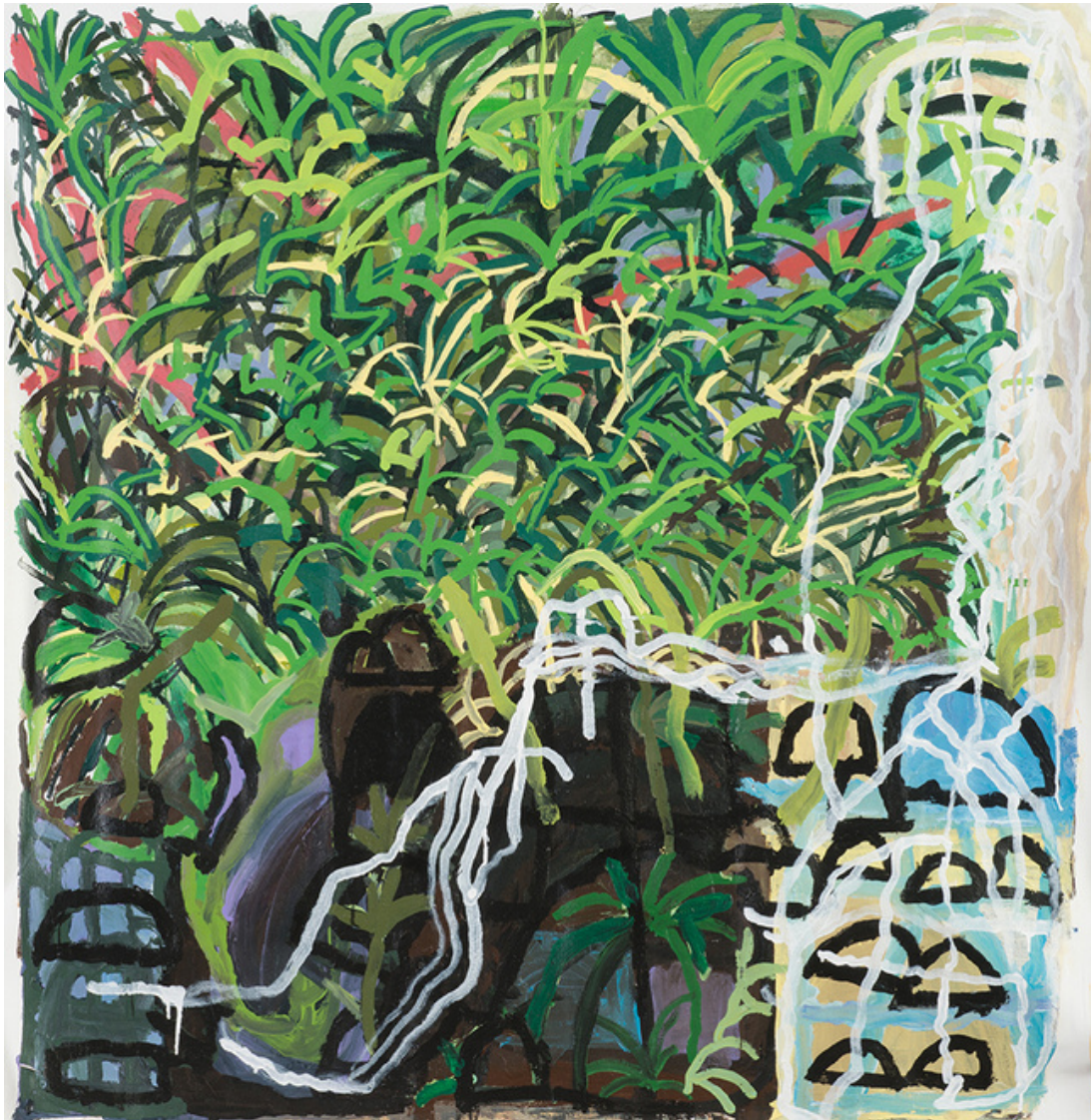
Not titled 2017 acrylic on canvas 116 x 112 cm GSCV17-0001 $1500 > purchase online