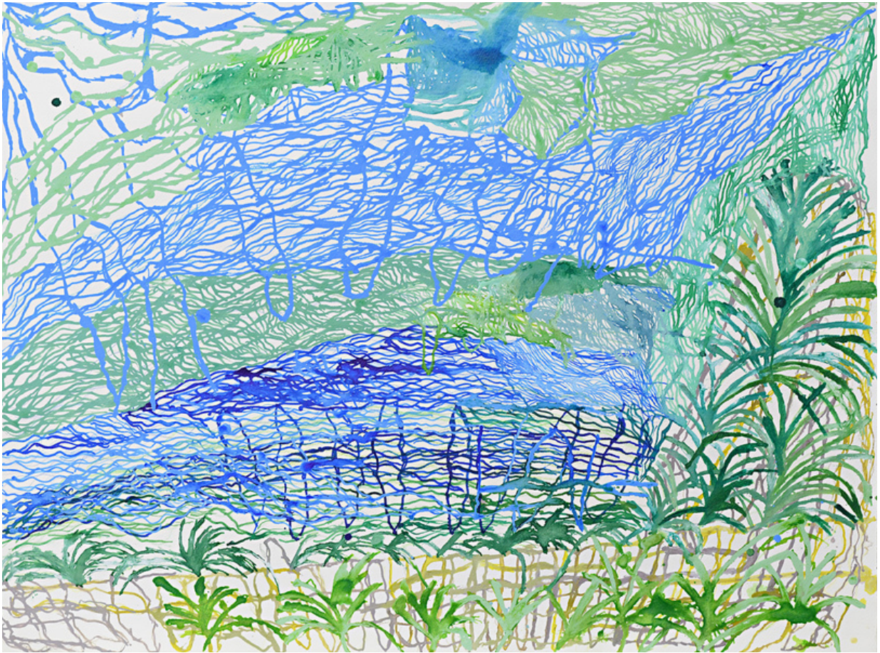
Island in Vogue and Beach 2019 gouache, ink and pencil on paper 56 x 75 cm GS18-0006 $380 > purchase online