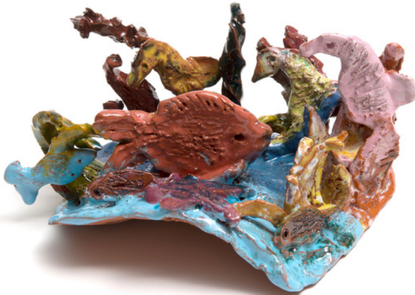
Not titled 2018 glazed earthenware 11.5 x 17 x 20.5 cm GSC18-0005 $140 > purchase online