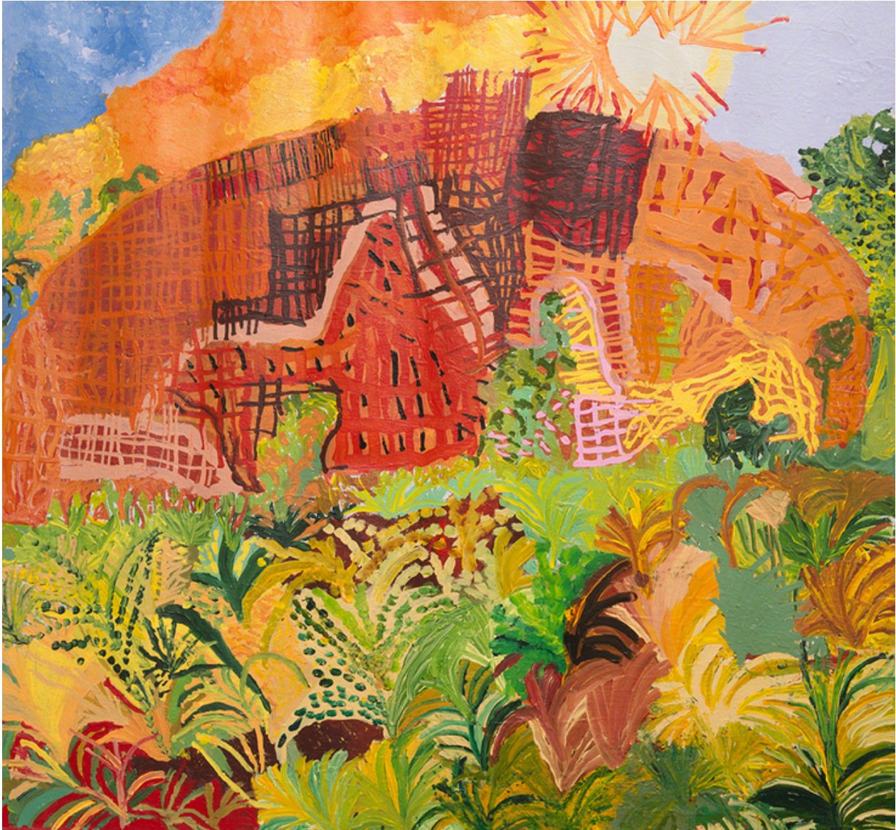
Not titled 2019 acrylic on canvas 88 x 78 cm GSCV19-0002 $500 > purchase online