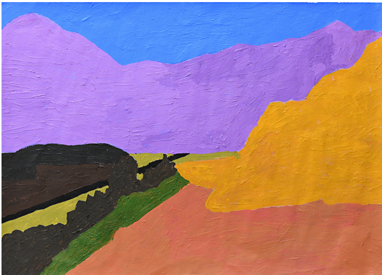
Not titled 2018 acrylic on paper 49.5 x 70 cm JB18-0013 $480 > purchase online