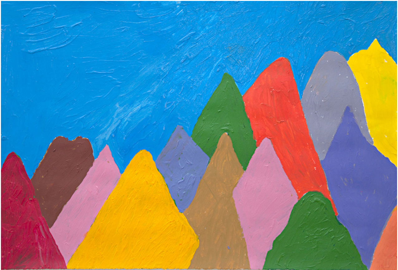
Not titled 2018 acrylic on paper 38 x 56 cm JB18-0003 $380 > purchase online