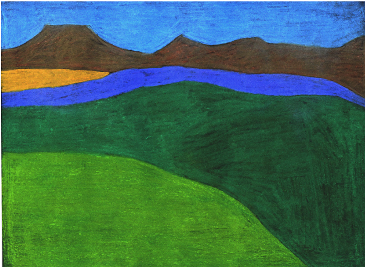
Not titled 2018 pastel on paper 48 x 65 cm JB18-0011 $480 > purchase online