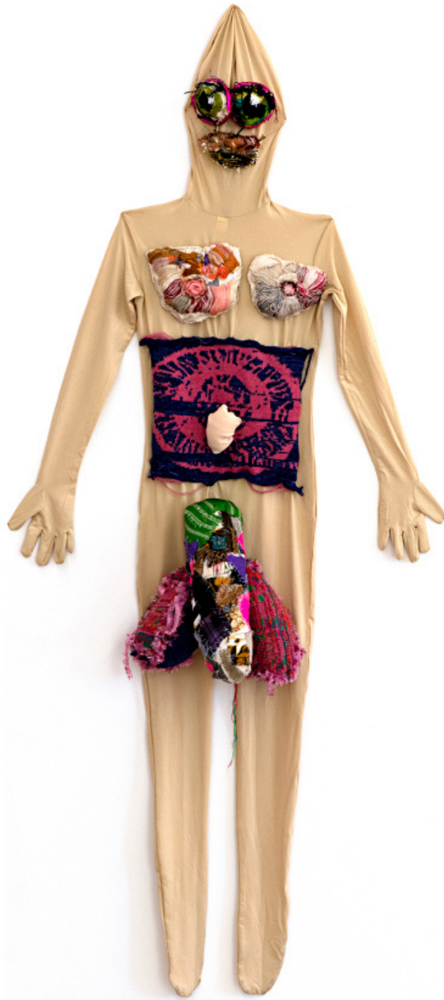
17 Bronwyn Hack Not titled 2021 cotton thread, material, and mixed media 165 x 83 x 14 cm BRHA3D21-0002 $1,200