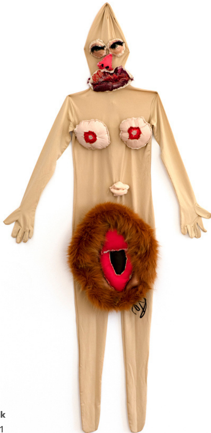
18 Bronwyn Hack Not titled 2021 cotton thread, material, and mixed media 165 x 83 x 11 cm BRHA3D21-0001 $1,200