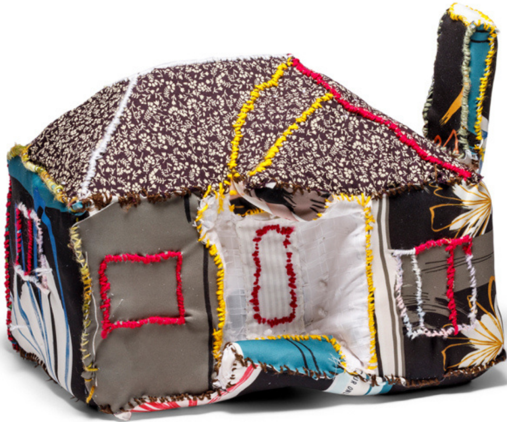
3 Chris O'Brien 17 Marjorie St 2021 foam, material, thread and wool 28 x 36 x 35 cm CO3D21-0002 $500