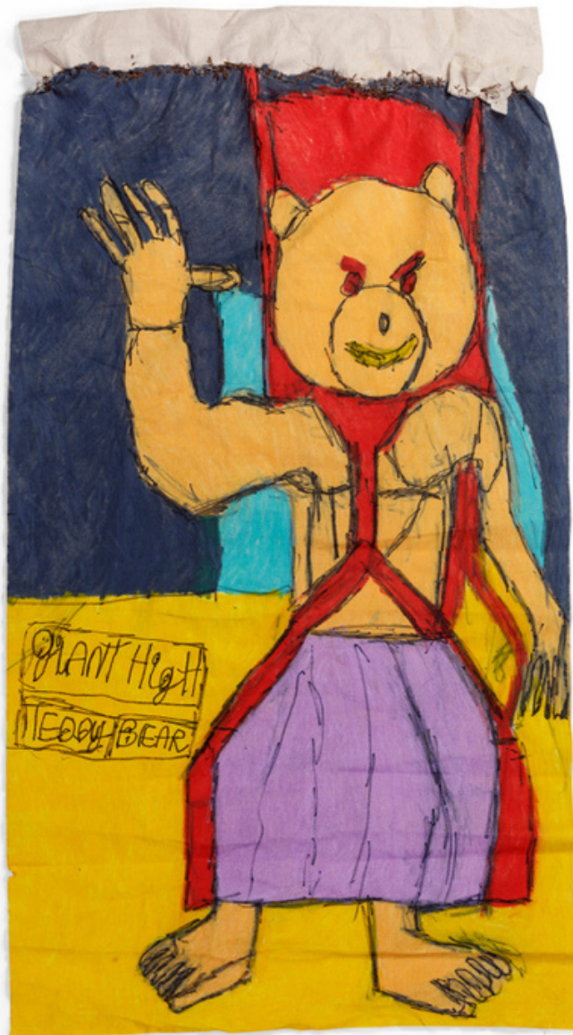
11 Adrian Lazzaro Giant High Teddy Bear 2021 calico, thread and paint pen 77 x 41.5 x 0.5 cm ADLATX21-0001 $380