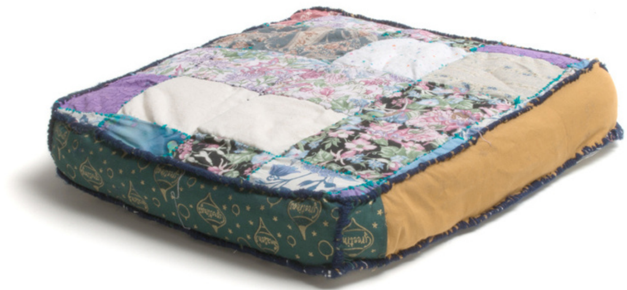
8 Chris O'Brien Pillow behind your back 2018 foam, material and wool 42 x 41 x 8 cm CO3D18-0004 $230