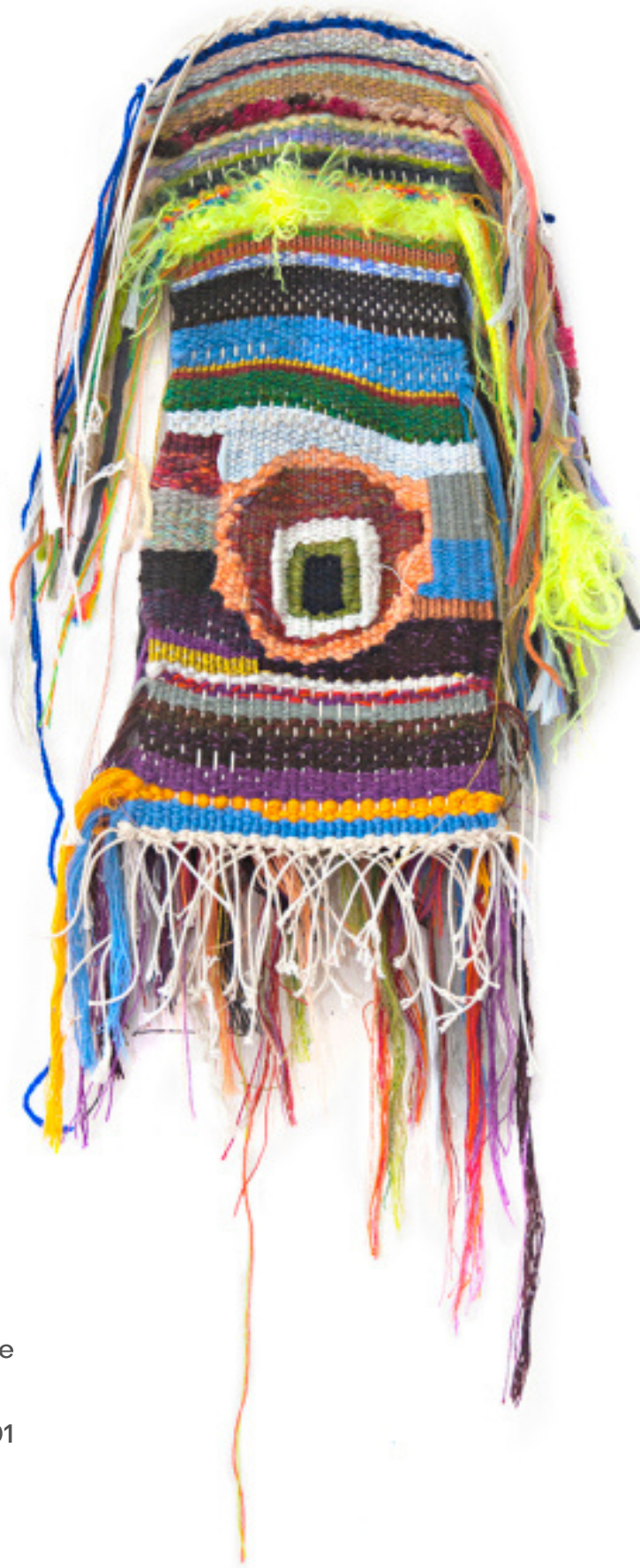
36 Bronwyn Hack Not titled 2019 thread and twine 35 x 15 x 2 cm BRHATX19-0001 $500