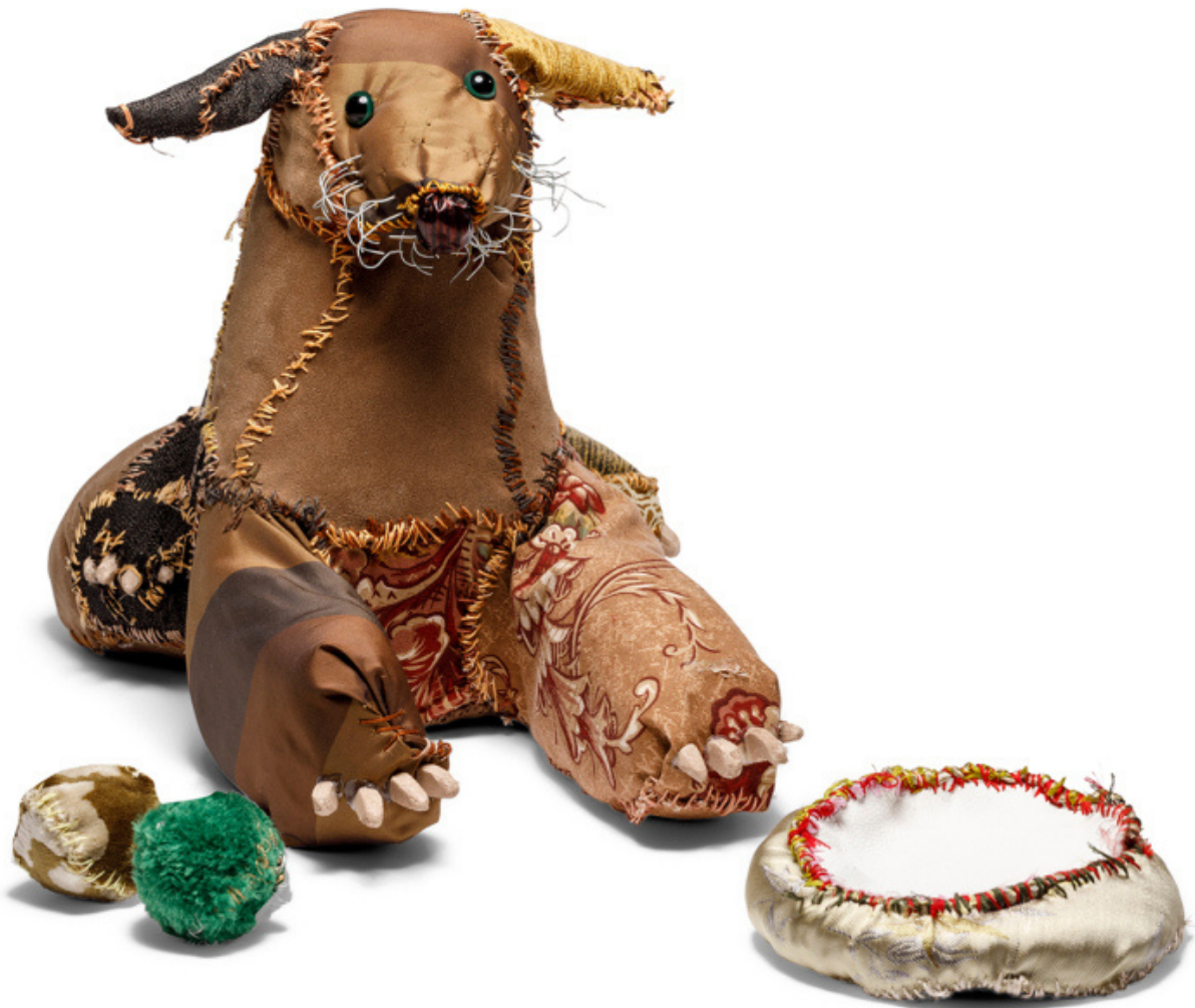
7 Matthew Gove Sunnys having a ball 2021 balsa wood, foam, material and thread 35 x 32 x 73 cm MAGO3D21-0001 Private collection