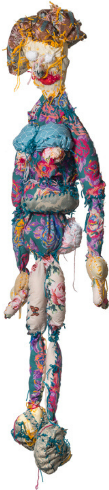
19 Terry Williams Lady 2019 material, stuffing and wool thread 153 x 55 x 25 cm TRW3D19-0010 $2,200