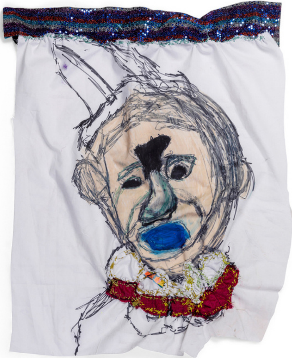
13 Adrian Lazzaro 80s Clown 2020 cotton, material, thread and other 56 x 46 x .5 cm ADLATX20-0001 $380