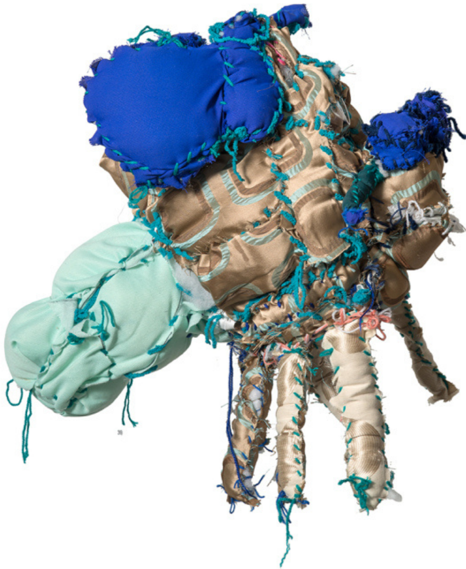
9 Terry Williams Bug 2019 material, stuffing, vinyl and wool 56 x 62 x 28 cm TRW3D19-0008 $1,200