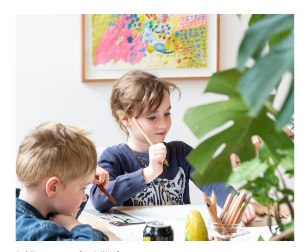
Public program for Still Life

Our Collingwood Yards gallery launched a successful suite of artist-led public programming. This initiative not only facilitated the professional growth of APA artists through paid positions but also helped to establish a stronger connection between the Northcote and Collingwood spaces, cultivating a sense of ownership for the artists in the gallery.