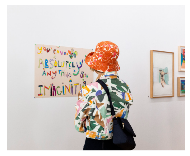
Art et al., Intersect at APA Collingwood Yards gallery

Over 11,000 people visited the gallery and the 2022 Annual Gala raised over $16,000 for our artists.