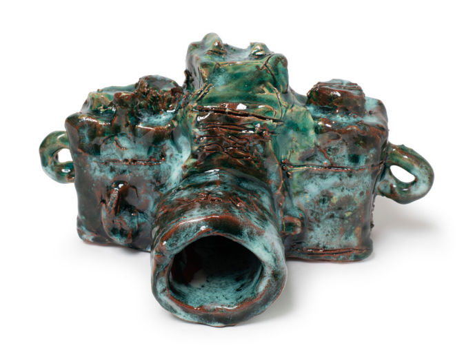
Alan Constable Untitled 2023