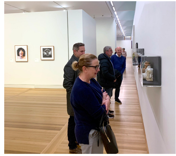
APA Creatives visit Canberra for Portrait 23: Identity