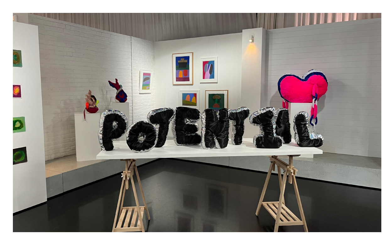
APA artists' work installed on the set of ABC show Art Works

to be a wonderful way for artists, staff, and APA Creative donors to connect over sketches, snacks, and a glass or two of wine.