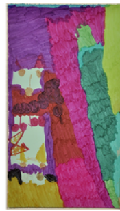
Rebecca Scibilia Beverly Hills Chihuahua 2009 marker on paper 28.5 x 8 cm RS09-0016 $250