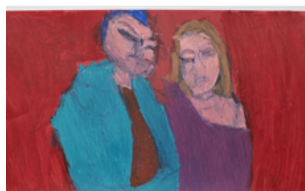
Adrian Lazzaro Untitled 2023 paint pen on paper 20 x 35 cm ADLA23-0009 $350