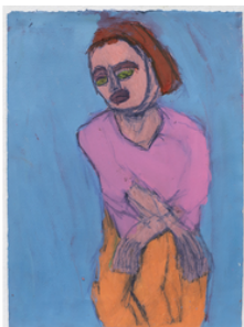
Adrian Lazzaro My Birtiful Lizard 2023 acrylic, paint pen on paper 38 x 28 cm ADLA23-0006 $350