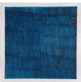
Roger Walker FM 492-01, 06/27/03 2003 ink on paper 20.3 x 20.3 cm EWRW03-0002 $1300 Courtesy of the artist and Fleisher/Ollman