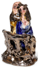
Bronwyn Hack Rose and Jack in Love on the Bow of the Ship 2022 earthenware, glaze 13.5 x 9.5 x 7.5 cm BRHAC22-0002 $300