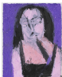
Adrian Lazzaro Untitled 2020 paint pen on paper 16 x 13 cm ADLA20-0024 $270