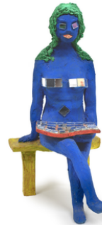
Jan Lucas I'll Look Into It 2009 earthenware 13 x 13 x 18 cm EWJLC09-0001 NFS Private Collection