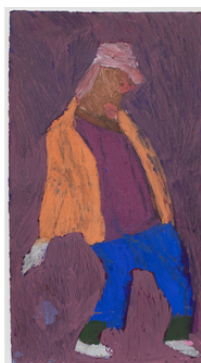
Adrian Lazzaro Untitled 2023 paint pen, marker on paper 38 x 20.5 cm ADLA23-0011 $350