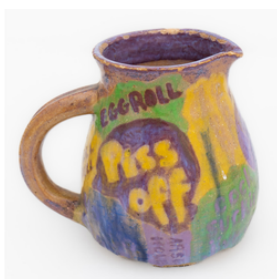
Jan Lucas No title (Piss Off) 2010 glaze, terracotta 12 x 8 x 6.5 cm EWJLC10-0001 NFS Private Collection