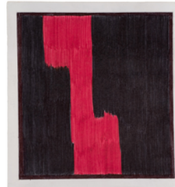
Roger Walker FM 090-02, 02 2002 graphite, ink on paper 20.3 x 20.3 cm EWRW02-0002 $1300