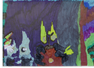
Rebecca Scibilia Beverly Hills Chihuahua 2009 marker on paper 25 x 35 cm RS09-0018 $300