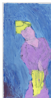
Adrian Lazzaro Untitled 2023 acrylic, paint pen on paper 38 x 19 cm ADLA23-0010 $350