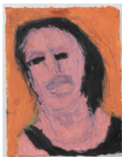
Adrian Lazzaro Untitled 2023 acrylic on paper 14 x 11 cm ADLA23-0023 $270