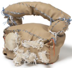
Terry Williams (Untitled) Radio 2024 cotton, material, string, stuffing, thread, beads, wire 51 x 59 x 35 cm TRW3D24-0002 $2200