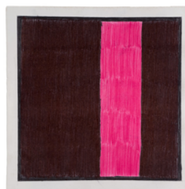
Roger Walker FM 107-02, 02 2002 graphite, ink on paper 20.3 x 20.3 cm EWRW02-0001 $1300