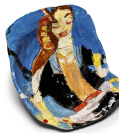
Bronwyn Hack I'm Flying Jack 2021 earthenware, glaze 5 x 16 x 20 cm BRHAC21-0015 $300