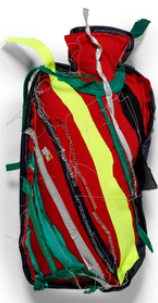
Bronwyn Hack Untitled 2021 cotton, material, string, stuffing, thread 56 x 21 x 12 cm BRHA3D21-0005 $500