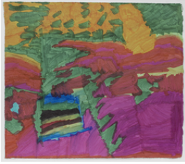
Rebecca Scibilia Dinosaur Bag 2009 marker on paper 25 x 28.5 cm RS09-0017 $250