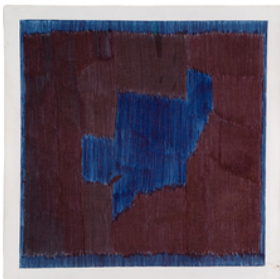
Roger Walker FM 111-02, 11/19/02 2002 graphite, ink on paper 20.3 x 20.3 cm EWRW02-0001 $1300