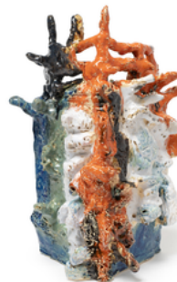
Bronwyn Hack The Big Bow of the Ship With Coral 2023 earthenware, glaze 36 x 20 x 22 cm BRHAC23-0008 $550