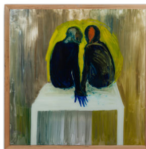
Clare Milledge Theoretical Headspace 2023 oil on tempered glass, reclaimed timber frame (Grevillea robusta) 124 x 124 cm EWCM23-0001 NFS