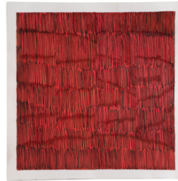
Roger Walker FM 631-03, 09/08/03 2003 ink on paper 20.3 x 20.3 cm EWRW03-0003 $1300