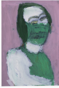
Adrian Lazzaro Sarah No 2 and Not Chuck 2023 acrylic, paint pen on paper 34.5 x 24 cm ADLA23-0001 $350