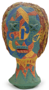
Jan Lucas Untitled 2010 glaze, terracotta 31 x 17 x 15.5 cm EWJLC10-0001 NFS Private Collection