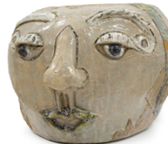
Jan Lucas Untitled 1995 glaze, stoneware 25.5 x 27 x 33 cm EWJLC95-0001 NFS Private Collection