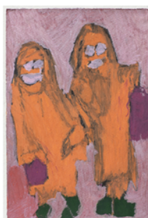
Adrian Lazzaro Winnie and Aggie as Ghosts 2023 acrylic, marker, paint pen on paper 28 x 19 cm ADLA23-0005 NFS Private Collection