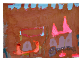
Rebecca Scibilia Untitled (red, pink and maroon) 2009 pastel on paper 17 x 25 cm RS09-0007 $200