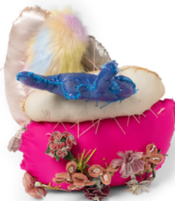
Bronwyn Hack Untitled 2023 cotton, material, string, stuffing, thread 34 x 33 x 18 cm BRHA3D23-0002 $500