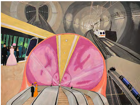
Miles Howard-Wilks Not titled 2011 gouache and ink on paper 57 x 75 cm Courtesy of the artist and Arts Project Australia, Melbourne