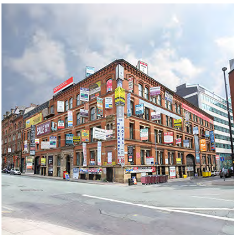
Junebum Park To Let 2015 type C print 101.6 x 101.6 cm