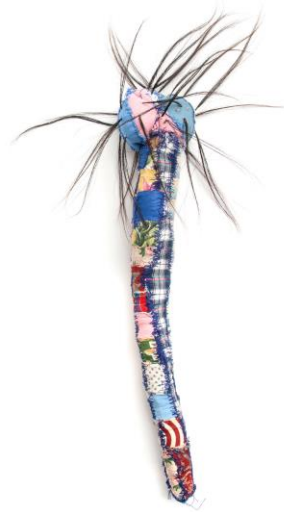
Left: Chris Mason, Reclining Nude , 2015, ceramic, 19.5 x 35.5 x 42 cm. Right: Bronwyn Hack, The Body Piece , 2017, calico, material, mixed media, stuffing and thread, 48 x 35 x 5 cm.