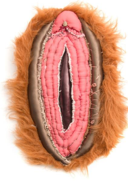
Image left: Bronwyn Hack, The Body Piece , 2017, calico, material, mixed media, stuffing and thread, 48 x 35 x 5 cm.